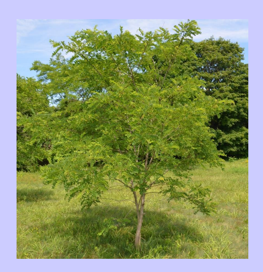
FIRST SEEDS: 6 years old